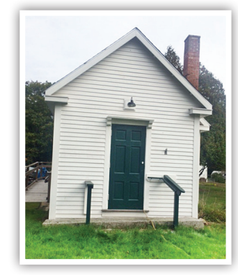
The Village School is looking good with a fresh coat of paint

Bottom: A handicap ramp is also being added to the library