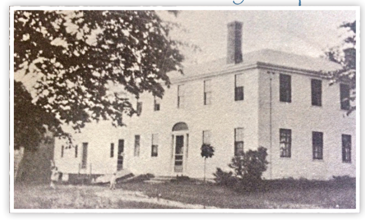
The Moses Little house as we see it today