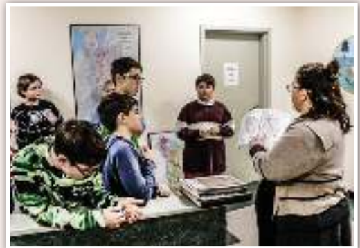
Top: Club members using compasses to get themselves to Town Hall to meet the Town Planner