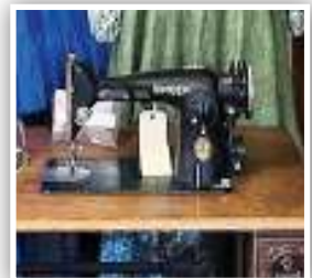
The students loved seeing the old sewing machine