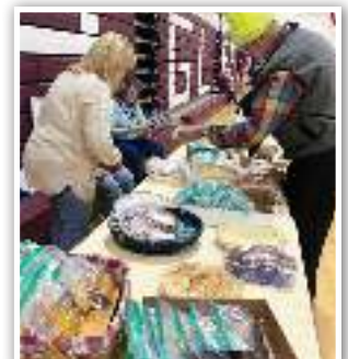
Windham voters were happy to see the return of our Bake Sale

Society members were so happy to get back to normal by once again having our Election Day Bake Sale at the November election. It was wonderful to see so many of the familiar faces from all around Windham! There was a delectable assortment of baked goods available, all homemade by the Society’s very talented bakers. I think Windham’s voters were happy to see our bake table back at the polls to be able to select from the variety of delicious treats we had to offer! It was a great day with a great reward. The $523 we made in profits truly did take the cake!