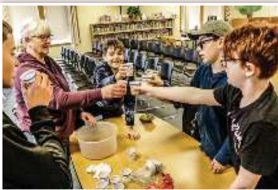
Top: History Club members playing Donuts-On-A-String